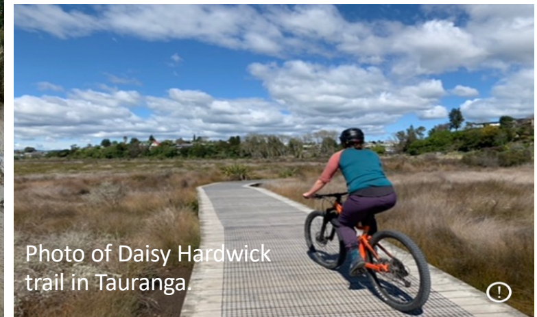
Photo of Daisy Hardwick trail in Tauranga.